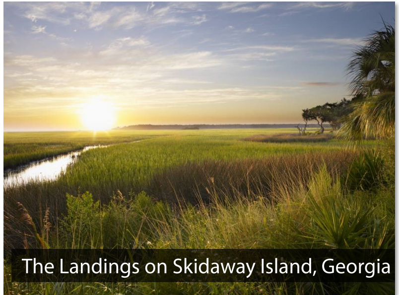
The Landings on Skidaway Island, Georgia

Skidaway Island, only 12 miles southeast of Savannah, is a jewel in Georgia's chain of barrier islands, reached by a sweeping causeway across tidal salt marsh and a bridge over the Intracoastal Waterway. The Landings, a private gated residential community of 8,500 on two-thirds of the island's 6,300 acres, has a long history of sensitive development. The Landings Community was started in the 1970s by the Branigar Corporation, and in 1972, the covenant documents were established to control the building types and land use in the community as development moved forward.