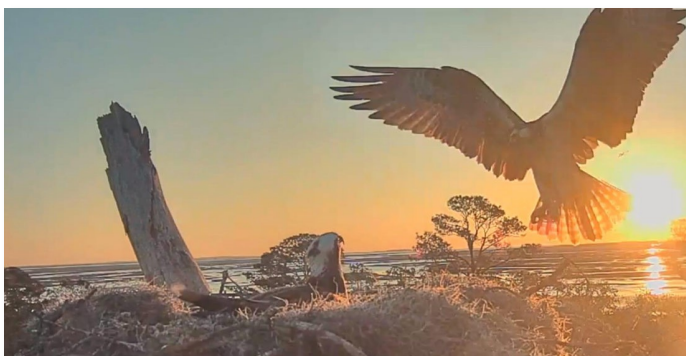
The Landings is home to a bird cam that offers a live feed of the two resident osprey.