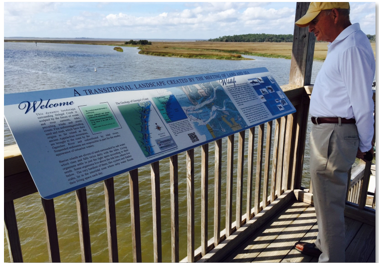
A component of the Sustainable Communities Program is a demonstration project, which is to provide educational information about sustainability to its residents. The Landings installed this informative sign at the Delegal Marina Tower for their demonstration project, providing viewers information about the Georgia coast.