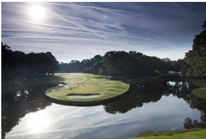
The Landings on Skidaway Island has six, certified Audubon Cooperative Sanctuary golf courses.

The Landings community offers 40 miles of walking trails through maritime forest of native pineland and live oak and extensive salt marsh habitat, a two-acre community garden, and many kayaking, fishing, boating, and birding